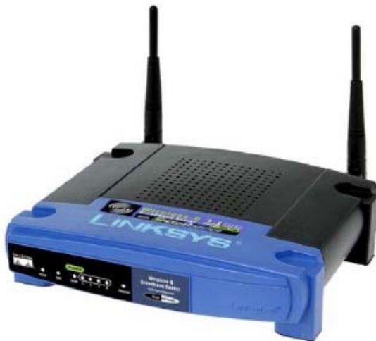
Figure 1: WRT54GS front view

Be aware that for specific laboratory practices it may be convenient that you erase the addresses configured by default after adding the ones you actually need.