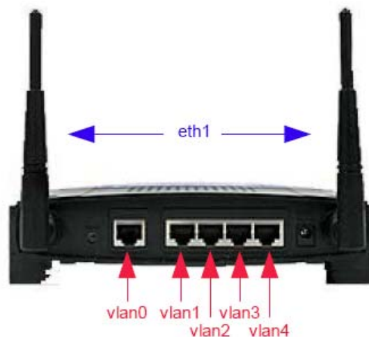
Figure 2: WRT54GS rear view

The router executes Linux as its Operating System, allowing the installation a series of different applications and utilities. For the Telematics Engineering Department laboratory practices, the installed software 1 allows the configuration of several of the router characteristics and to experiment with router configuration aspects in a way very similar to larger commercial routers. There are 2 complementary ways to access the router: