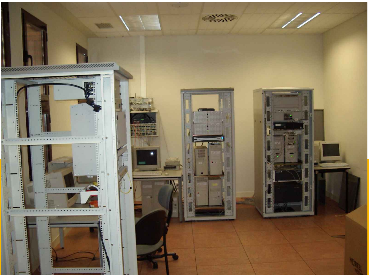
High performance communications infrastructure of the Telematic Engineering department