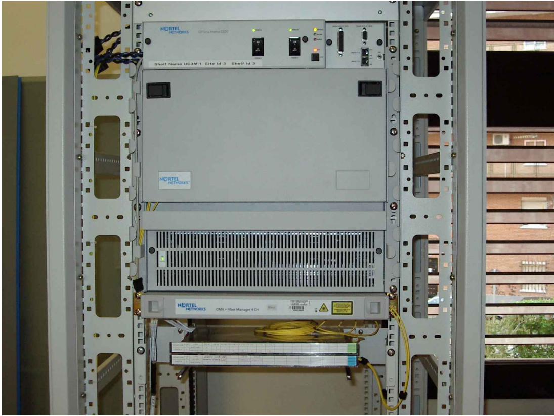
High performance communications infrastructure of the Telematic Engineering department