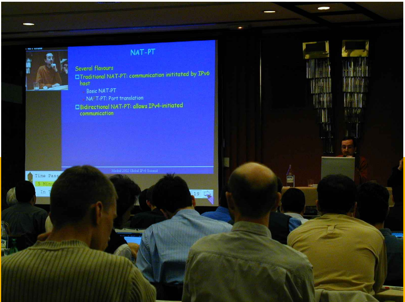
Telematic Engineering department researchers participating in the IPv6 Forum (Madrid)

We have established a large number of successful collaborations with institutions and companies, both Spanish and foreign, through R&D projects, consultancies and service provision. We count among our main partners the Ministry of Science and Technology (Ministerio de Ciencia y Tecnología), the Madrid regional government (Comunidad de Madrid), Telefónica, Agencia EFE, Ericsson, Portugal Telecom, Bankinter, Deutsche Telecom, Philips Research Eindhoven, ABB Norway y Nokia Finland. We have established mutually-beneficial long-term strategic alliances with Nortel, Nokia and Telefónica. We are acting as project leader in several projects of the European programs IST, @LIS, MEDEA+ and ITEA.